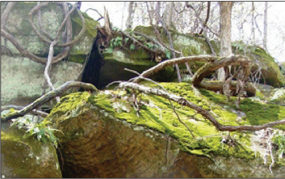
Rock outcroppings are one of the interesting natural features of Liberty Park.