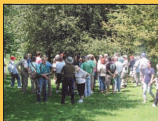
The event drew a crowd of about 60 to Brunswick Hills Township.