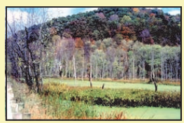
The 5,492-acre Killbuck Marsh is Ohio's largest freshwater wildlife marsh.

The Land Conservancy works with more than 50 conservation partners in northern Ohio. The Killbuck Watershed Land Trust, one of those allies, is making a difference in Wayne County.